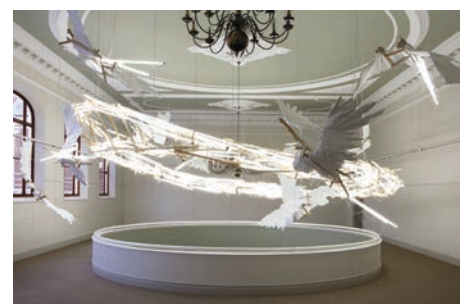
Wim Botha, Solipsis V , 2013, Polystyrene, wood, fluorescent tubes (Installation view, Sasol Art Museum, Stellenbosch).