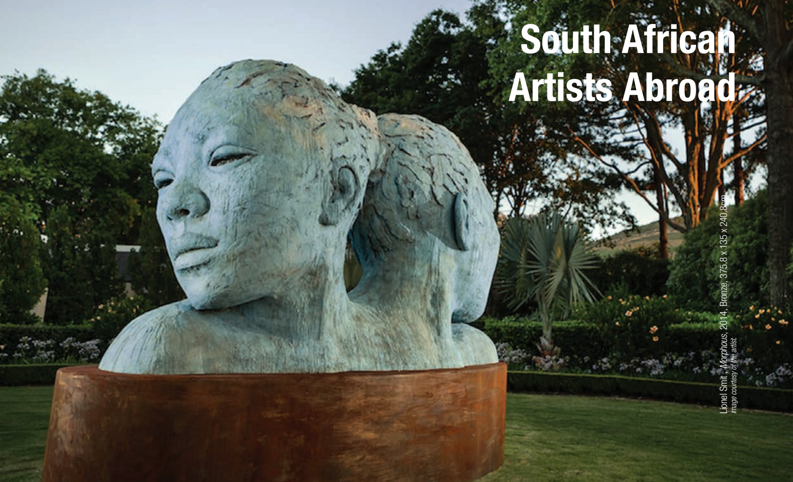
Lionel Smit, Morphous , 2014, Bronze, 375.8 x 135 x 240.8cm